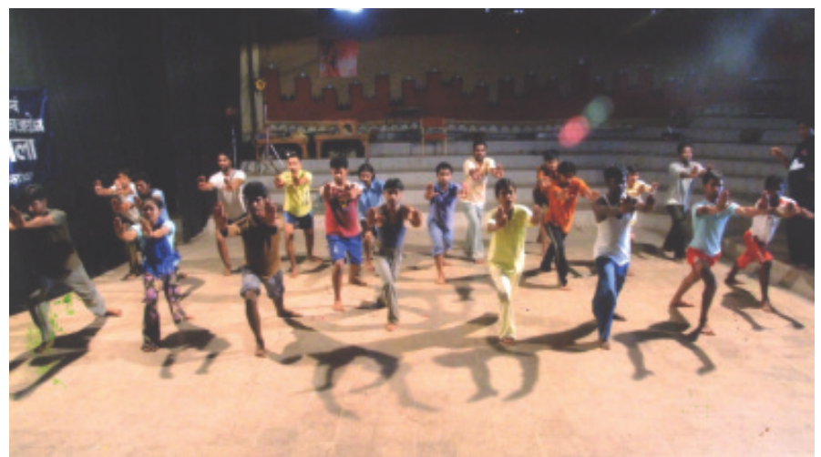
Top: Make-up practice session at workshop. Above: A glimpse of Kalaripayattu.