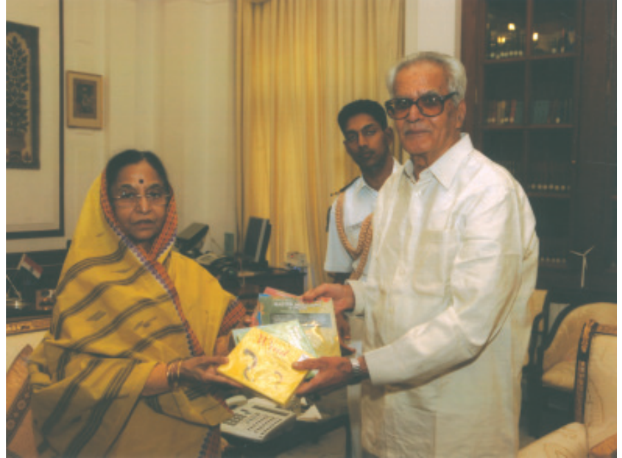
Shri Ram Niwas Mirdha, Chairman, Sangeet Natak Akademi presents a set of Akademi Publications and compact discs (CDs) of Master Musicians of India to Shrimati Pratibha Devisingh Patil, President of India at Rashtrapati Bhavan, New Delhi on 31st July 2007.