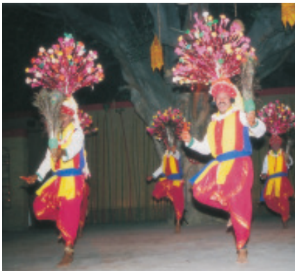
Suggi Kunitha, Karnataka.